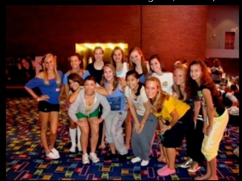
WOW! What an exciting couple of days!